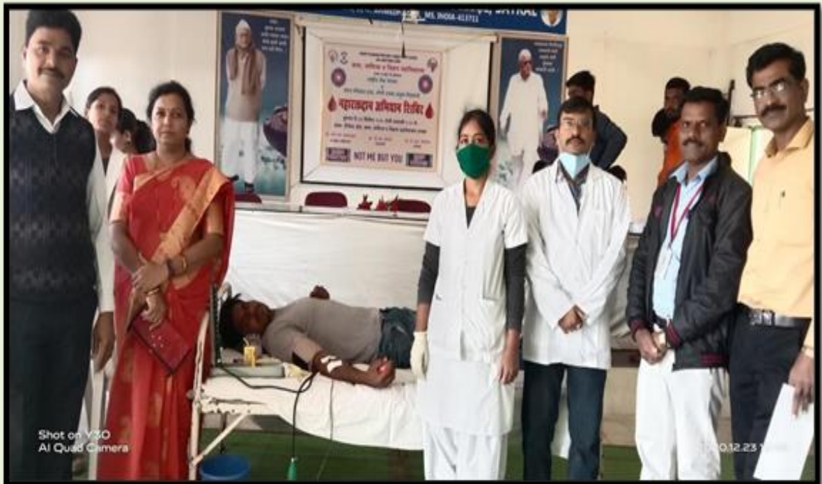
As a social responsibility NSS unit organize a Blood donation camp in COVID pandemic