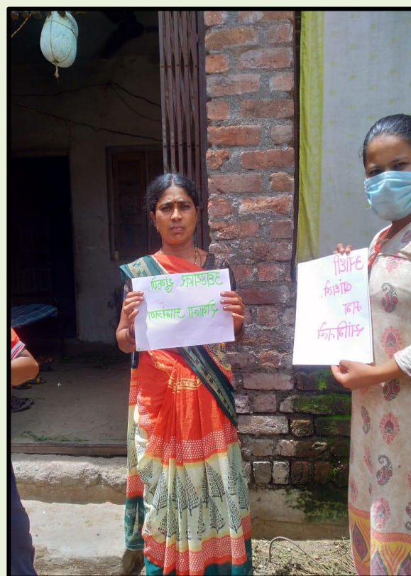
COVID-19 Awareness among adopted families