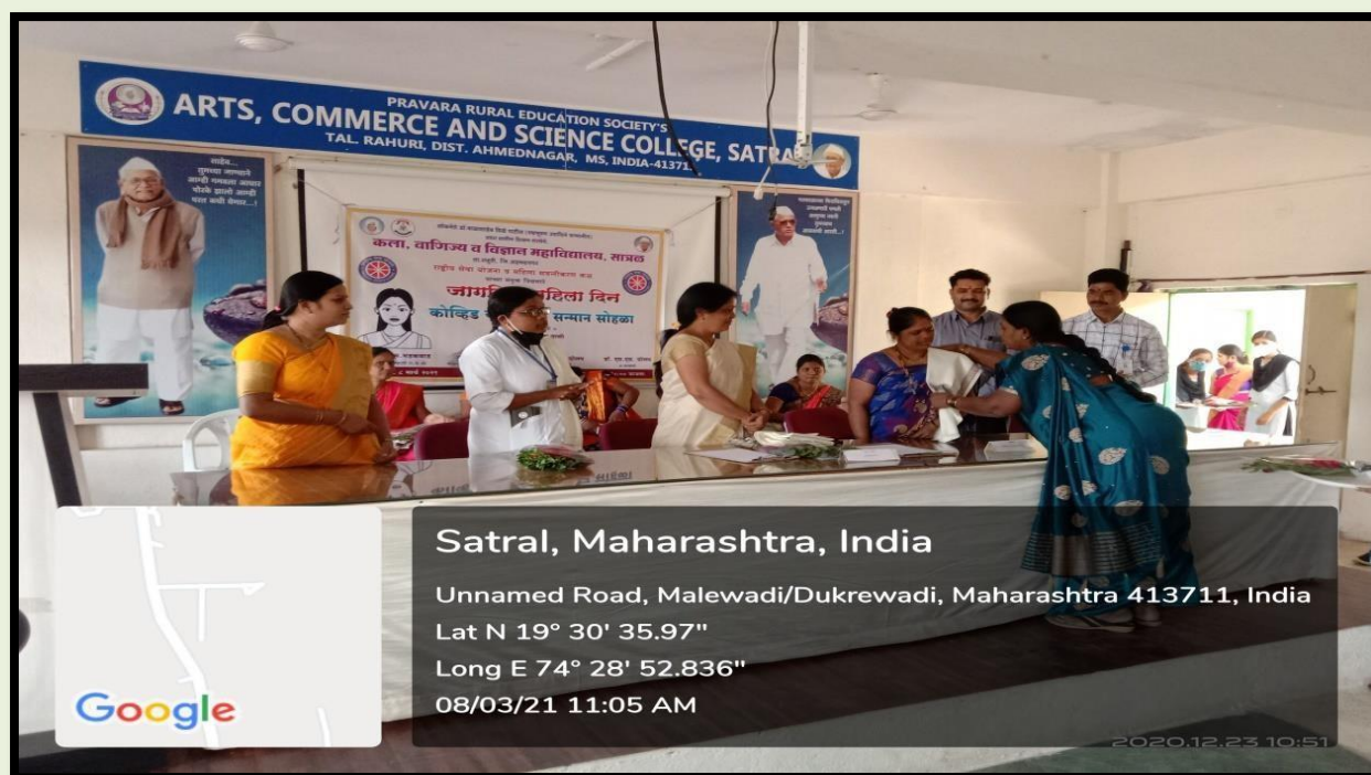
Felicitation of Anganwadi sevika and Asha worker for his great work in COVID pandemic

On March 8, 2021, Arts, Commerce and Science College, Satral organized a heartfelt tribute to recognize the invaluable contributions of female health workers and Anganwadi workers from Satral as COVID-19 warriors. These dedicated individuals were celebrated for their unwavering commitment and selfless service in the face of the pandemic's challenges. The event not only acknowledged their tireless efforts in healthcare and community support but also highlighted the resilience and dedication essential to combating COVID-19. Through this gesture of appreciation, the college underscored the importance of honouring frontline workers who have played a crucial role in safeguarding public health and wellbeing during these unprecedented times.