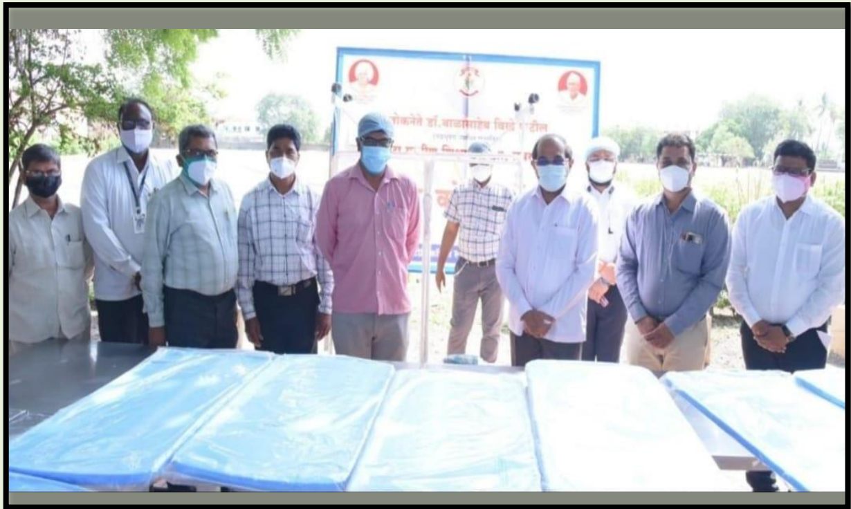
Medical Equipment Handover to Pravara COVID Center

Teaching and non-teaching staff of the Arts, Commerce, and Science College, Satral, part of the Loknete Dr. Balasaheb Vikhe Patil (Padma Bhushan Awardee) Pravara Rural Education Society, made a significant contribution to the Pravara COVID Care Center, in Loni. They donated medical equipment worth Rs. 56,404, which included monitor stands and bedside screens. This generous donation played a crucial role in enhancing the care center's capacity to treat COVID-19 patients. Their efforts exemplify the institute's commitment to community service and its proactive response to the pandemic, ensuring better healthcare support for the affected individuals. This act of solidarity and compassion underscores the vital role of educational institutions in supporting public health initiatives.