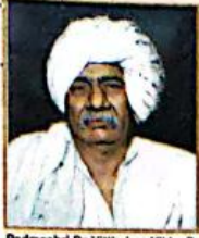
Padmashri Dr. Vitthalrao Vikhe Patil (1901-1980)