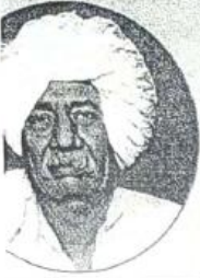
Dr. Vitthalrao Vikhe Patil 1901-1980