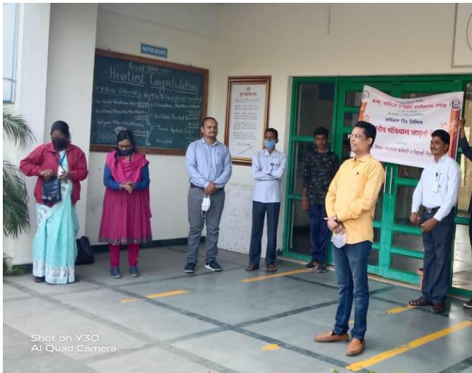
Indian Constitution Day