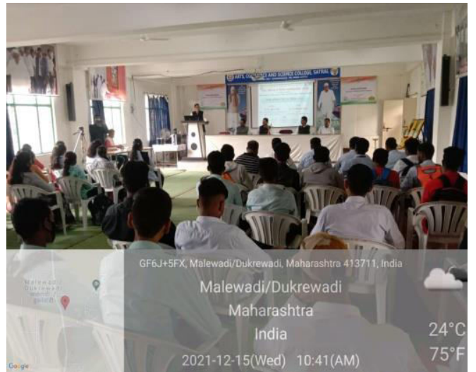
World Human Rights Day