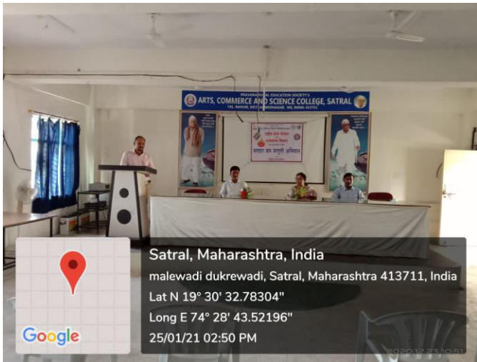
National Voters Day: