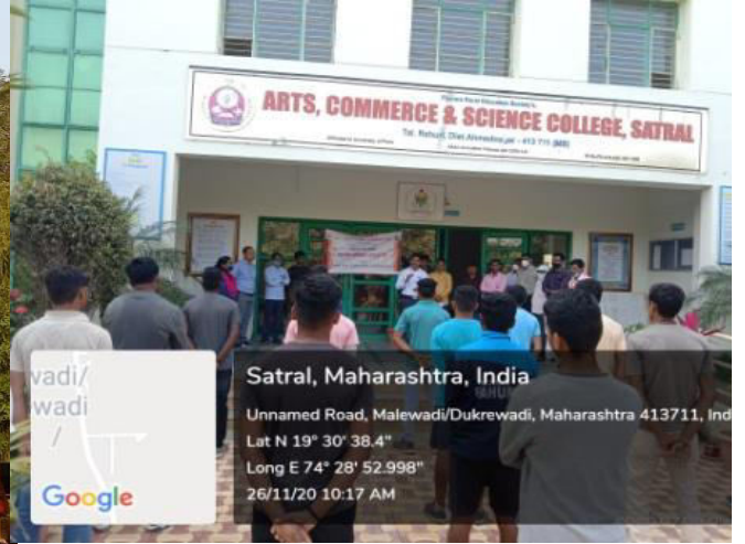
Indian Constitution Day