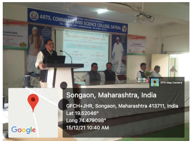
Human Rights Day