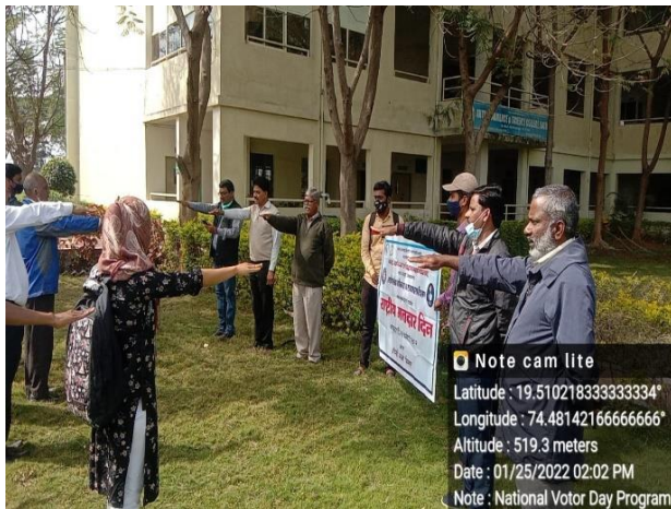
National Voters Day