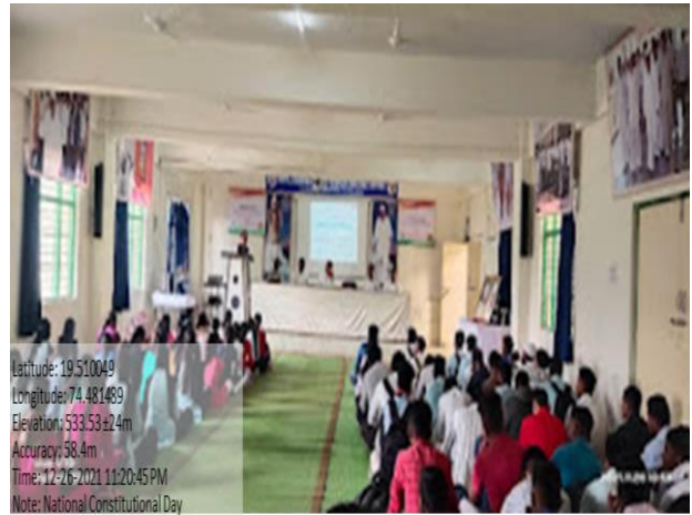
National Constitutional Day