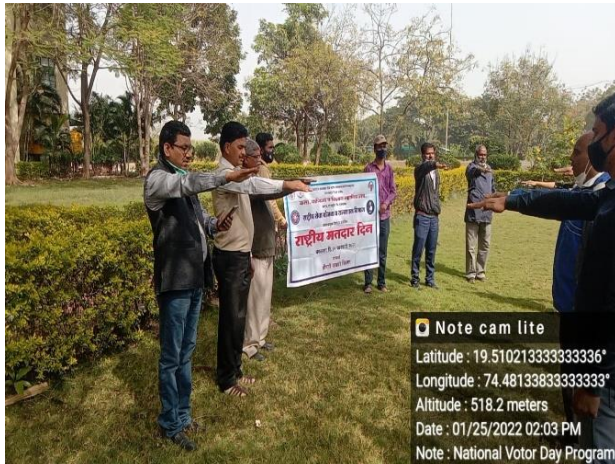
National Voters Day